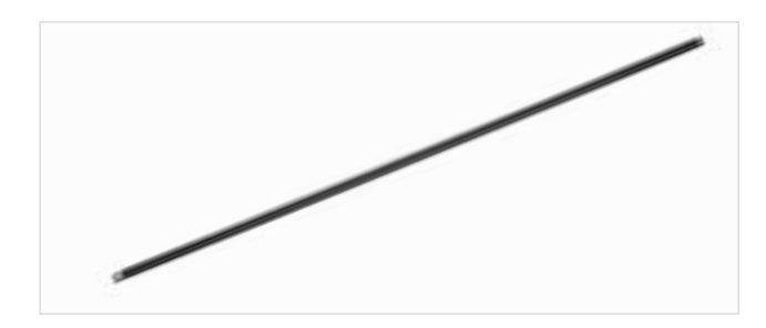
VT 29 carbon poles - 29 or 42 mm diameter Connectable carbon poles for deployment of cameras and tools - standard lengths are 1 and 2 m