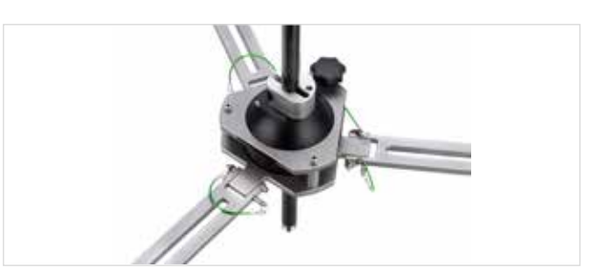
Manhole holder Versatile positioner for 29 or 42 mm carbon poles