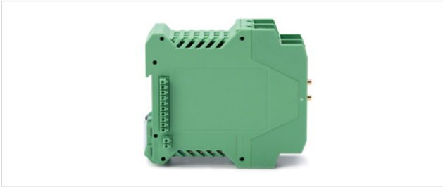
VT CamCtrl side view