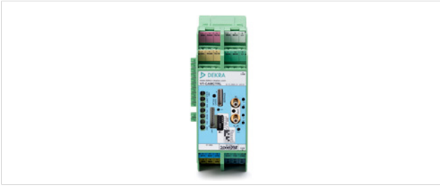
VT CamCtrl front view