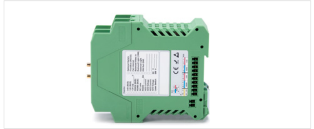
VT CamCtrl side view

DEKRA Visatec GmbH Gewerbepark 7 87477 Sulzberg/See Germany Tel. + 49.8376.9215 0 info.dvg@dekra.com