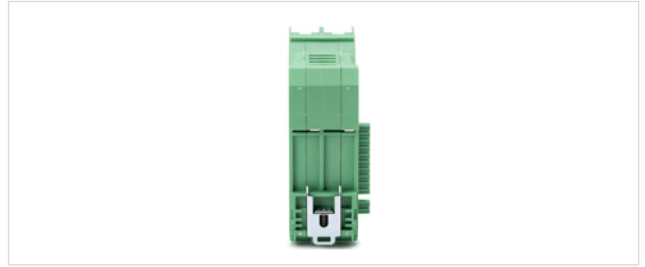
VT CamCtrl back view