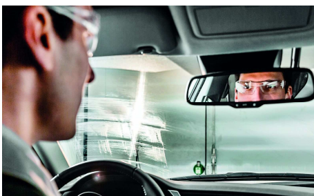
Lubricating film on the windshield: Limited visibility can result

Moving into the centennial year of its existence, DEKRA is excellently positioned and successfully continuing its transformation from a traditional vehicle inspector into the leading independent expert for digital and software-defined mobility. Despite the prevailing volatile economic and geopolitical environment, the company has continued to grow. Global sales increased by 4.7 percent to €4.29 billion compared to the previous year, while in the core business – excluding temp work – they increased by 7 percent. EBIT increased by 4.2 percent to €266 million, while EBITDA reached €480.1 million, up 5.4 percent. In addition, the permanent workforce grew by 800 employees to around 33,000. In total, around 48,000 experts are currently working worldwide for the world's leading non-listed inspection organization. (DEKRA Info)