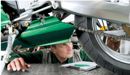
Used bikes: Get an expert opinion before buying