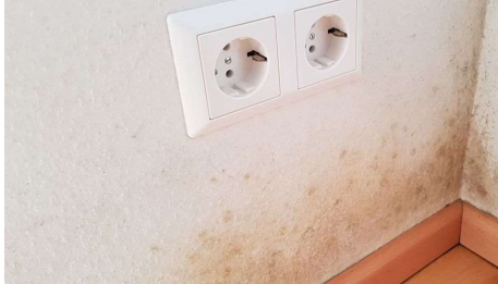
Checking for mold in the home: A hazard for the respiratory system

Photo: DEKRA Reproduction free of charge. Please mention DEKRA and send reference copy.