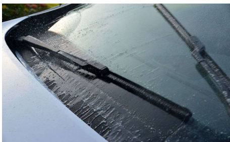
Non-functioning windshield wipers: Defect in German statutory inspections

Anyone intending to buy a used motorbike for the new season should take thorough advice before doing so – this is the recommendation from DEKRA's experts. In 2024, more than 468,000 used bikes changed owner. Specialist magazines, the Internet, and friends can provide information to back the decision. However, an experienced motorcycle expert should always be consulted, because four eyes see more than two. DEKRA has prepared a practical checklist covering the aspects that should be considered before buying. These range from identity, mileage, and checking for technical modifications, through warranty and exhaust, to test ride and purchase contract. It should also be ensured that a battery certificate is available in the case of electric motorcycles. ( https://www.dekra.de/de/tipps-fuer-biker/ ) (DEKRA Info)