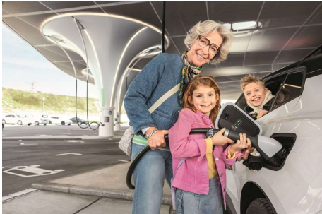
DEKRA Road Safety Report 2025: Safe mobility for everyone

Photo: DEKRA Reproduction free of charge. Please mention DEKRA and send reference copy.