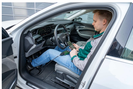
Battery quick test by DEKRA: 15 minutes for clarity

Photo: DEKRA Reproduction free of charge. Please mention DEKRA and send reference copy.