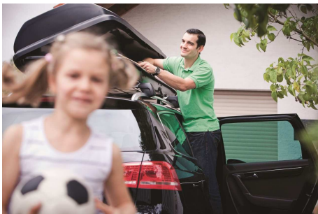
Safely on vacation: Load your car like a pro

Photo: DEKRA Reproduction free of charge. Please mention DEKRA and send reference copy.