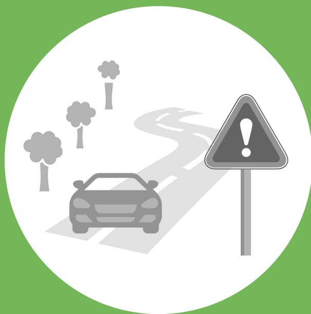
on the road