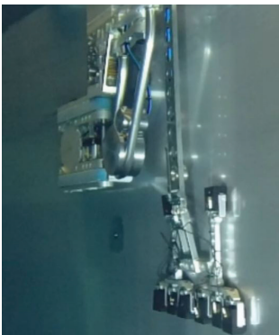
Ringhorne - ID inspection of vessels

Excellent customer response has been achieved after the performed inspection.