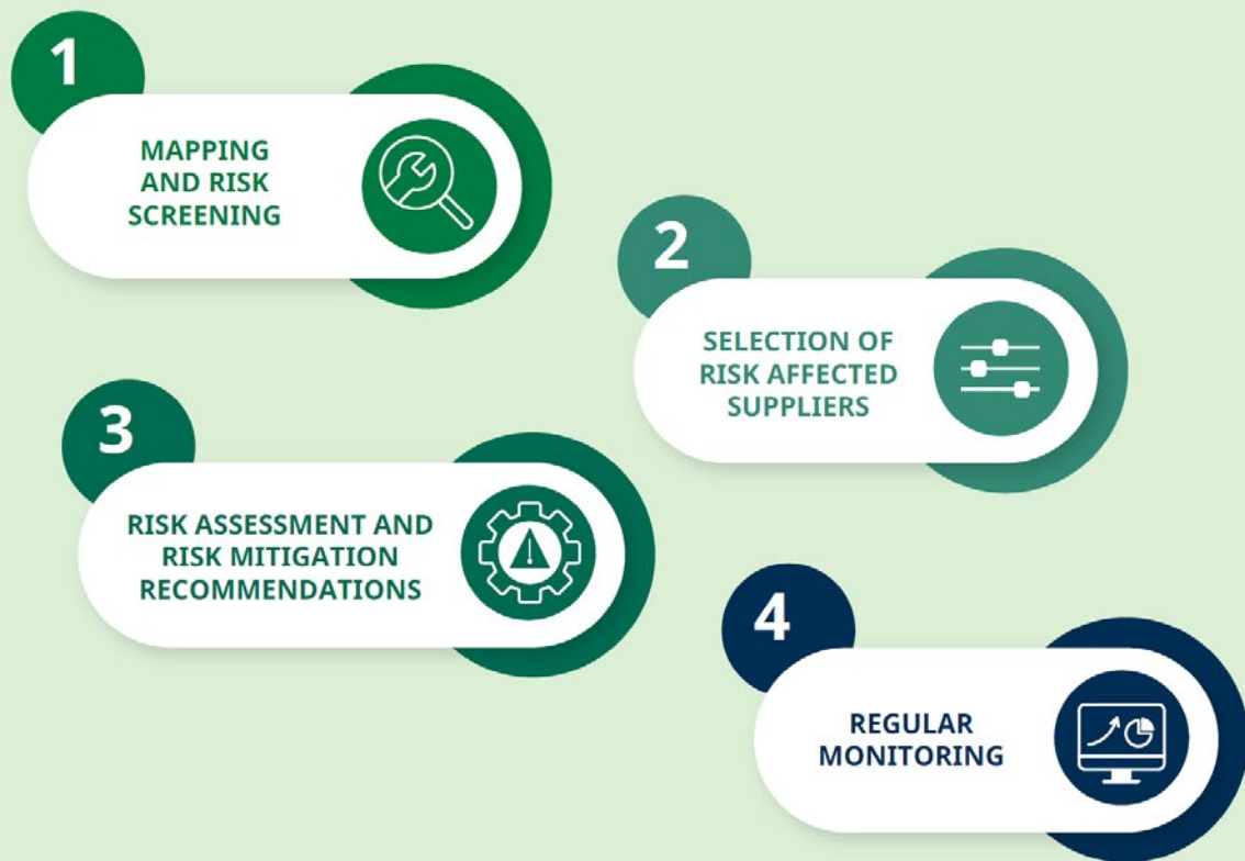
Process of our Supply Chain Risk Management services

Our services help you expose traces of sanctions rules busting, modern slavery, human and labour rights violations, environmental issues, health and safety hazards, fraud, data breach, GDPR non-compliance and many more risks that may affect your brand reputation or disrupt your supply chains. Mapping provides a complete view and proper analysis of deeper problems to determine a supplier risk score.