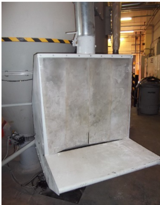
IMAGE 1. SACK RIP AND TIP STATION (WITH MECHANICAL VENTILATION AND SHELF)

Manual charging of flammable powders is often undertaken using proprietary sack rip and tip stations. There are many variants available and used in industry. Some stations are provided with forced ventilation to aid in the removal of fugitive, airborne dust roused as a result of the tipping operation. Mechanical ventilation serves to limit the risk of exposure to the operator and equally reduce the longevity of a flammable dust concentration persisting within the station. This assumes the level of ventilation is sufficiently high.